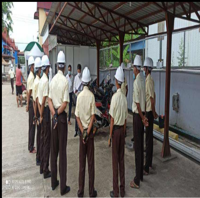
Security Training Instruction from Safety Manager