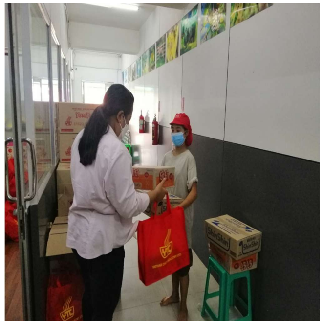
Company provides Thidingyut Package to employees