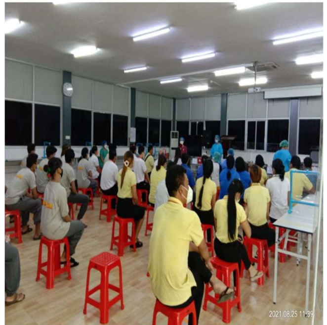
All Employees are vaccinated against Coronavirus disease Covid-19.

Yathar Cho Industry Limited discusses the epidemic with expert doctors and human resources teams to ensure that employees in the workplace can be prevented from contracting the virus in the Covid-19 factory.