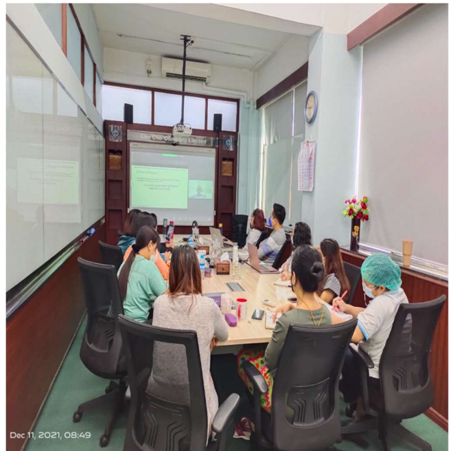
Basic Concepts and Applications of Statistics Awareness Training