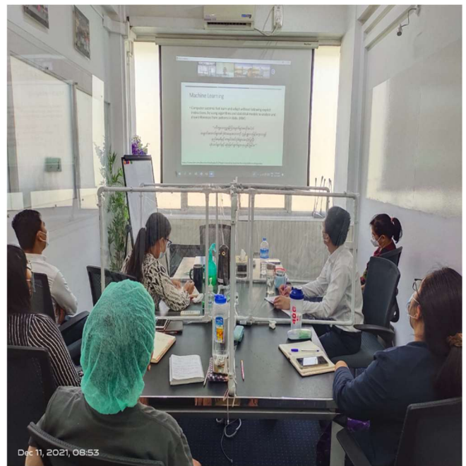
Artificial Intelligence , Machine Learning & Data Science Awareness Training