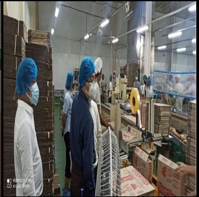
Covid-19 Prevention Inspection in accordance with Covid check list to avoid health hazards in the workplace.