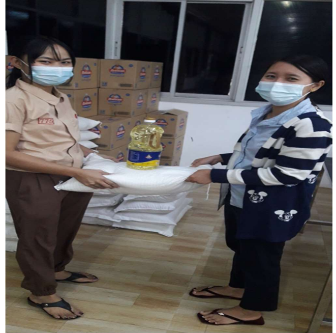
Providing rice and oil food to staff during the covid-19 period.